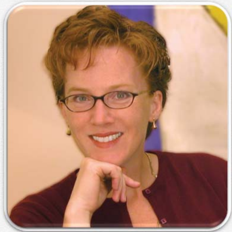
BMO Financial Group Professor