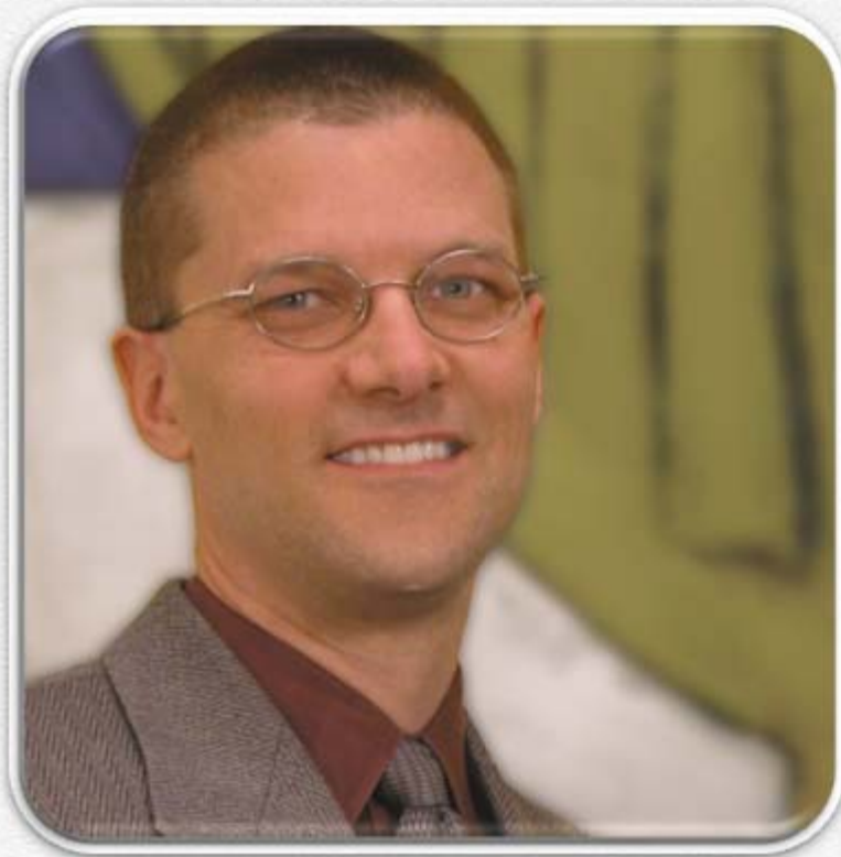
Richard and Elizabeth Currie Chair